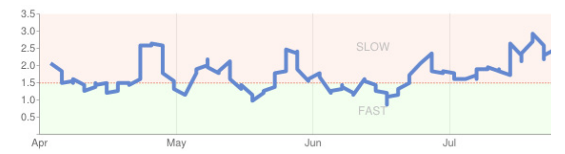
(Google Webmaster Tool sites performance stats)